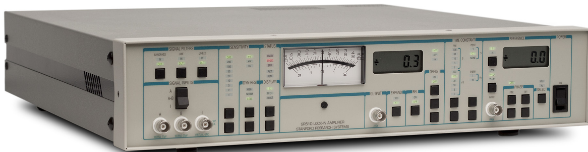
SR510 Lock-In Amplifier

An optional internal voltage-controlled oscillator provides both an adjustable-amplitude sine wave output and a synchronous, fixed-amplitude reference output. The sine wave amplitude can be set to 0.01, 0.1 or 1 Vrms, and can drive up to 20 mA. The oscillator frequency is controlled by a rear-panel voltage input and can be adjusted between 1 Hz and 100 kHz. Typically, the sine wave output is used to excite some aspect of an experiment, while the reference output provides a frequency reference to the lock-in.