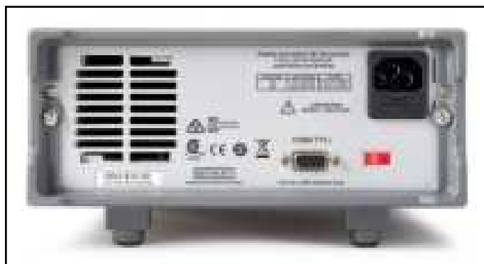
Model 2231A-30-3 rear panel showing the communication port, line power setting switch, and the power input connector with fuse holder.